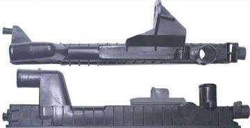
9075 / Twingo 1.0 93 Superior