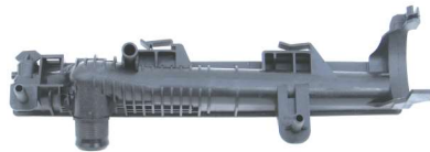
7151 / Fluence 2.0 Inferior Bocal Torto