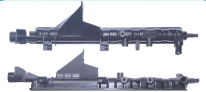
9078 / Twingo Inferior Bico Reto