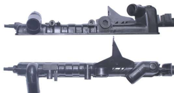
9077 / Twingo Superior Bocal Torto