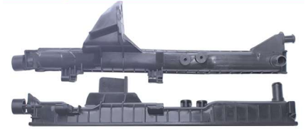
9074 / Twingo 1.0 93 Inferior