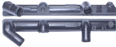
8038 / Master Superior 98/03