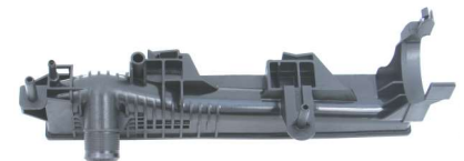
7155 / Fluence Inferior Bocal Reto