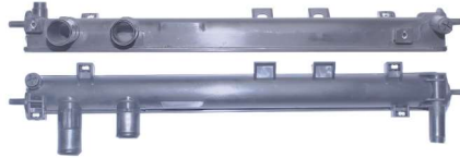
9083 / Tribeca Inferior 06/14