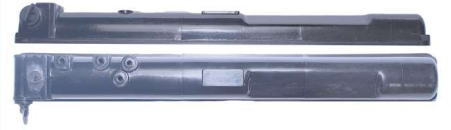
7162 / Master Inferior 98/03