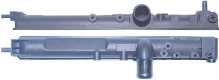
7502 / R19 1.8 Inferior 94 / 99