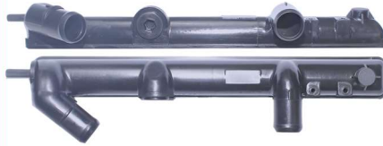
7161 / Master Superior 98/03