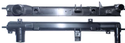
9088 / Tribeca Superior 06/14